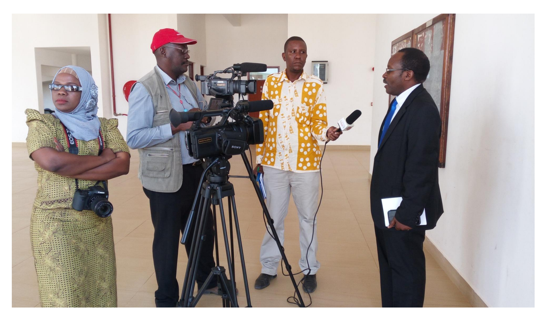
Figure 3: Prof. A. Mvuma during Media Interview after Officially Opening ICANNWiki Swahili Workshop Channel 10 Television Workshop Coverage: <a href="https://youtu.be/z3skn79_maE">https://youtu.be/z3skn79_maE</a>