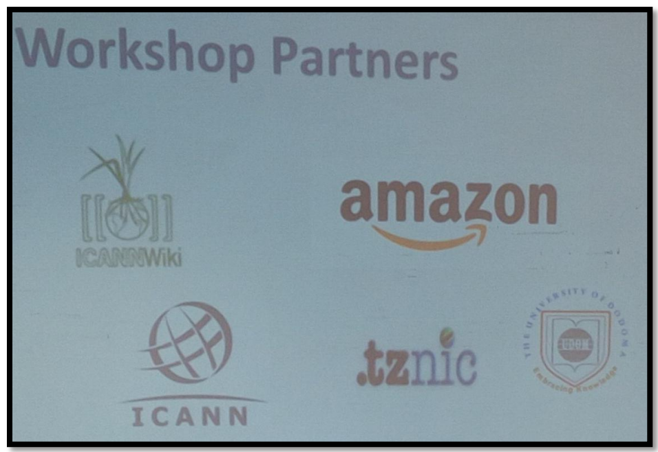
Figure 1: ICANNWiki Swahili Translation Workshop Partners

This workshop was co-funded by ICANN, ICANNWiki, Amazon and UDOM. The sponsorship covered breakfast, lunch, stationeries and some administrative costs.